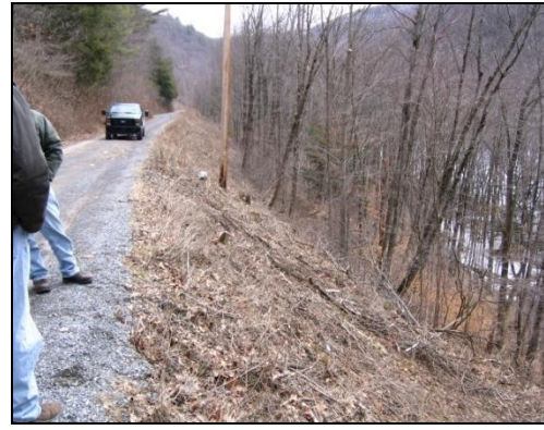
Slate Run Road (before): The bank instability here is caused by the many springs and seeps that saturate the site every year.