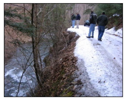
Francis Road (before): The bank instability here was caused by the proximity to the stream.

Two sections of roadway, one on Slate Run Road and one on Francis Road, have been continual problems for maintenance crews due to the threat of landslides. The landslide problem on Francis Road was caused by the road's proximity to a stream, while the problem on Slate Run Road was caused by steep side slopes and saturated soil conditions.