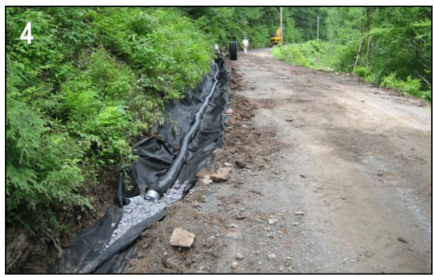
Slate Run Rd: 2,000 feet of underdrain was installed due to the many springs and seeps that kept the road area saturated for much of the year.

This publication is available in alternative media upon request. The Pennsylvania State University is committed to the policy that all persons shall have equal access to programs, facilities, PENNSTATE admission, and employment without regard to personal characteristics not related to ability, performance, or qualification as determined by University policy or by state or federal authorities. The Pennsylvania State University does not discriminate against any person because of age, ancestry, color, disability or handicap, national origin, race, religious creed, sex, sexual orientation, or veteran status. Direct all affirmative action inquiries to the Affirmative Action Office, The Pennsylvania State University, 201 Willard Building, University Park, PA 16802-2801; tel. (814) 863-0471; TDD (814) 865-3175. U.Ed #RES-01-50.