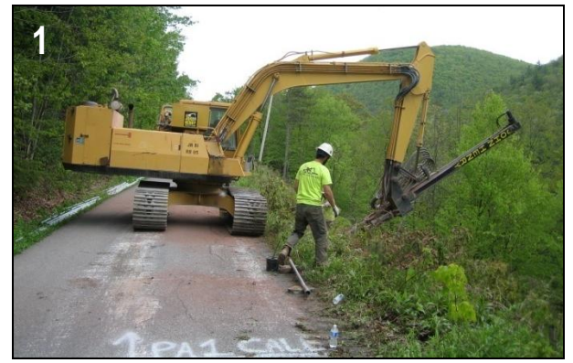
Slate Run Rd: Soil nail holes are drilled into the road slope.

In addition to the slope stabilization on both roads, many other Environmentally Sensitive Maintenance Practices were implemented on Slate Run Road. Six new crosspipes were installed to reduce concentrated drainage along the roadway. Approximately 2,000 feet of underdrain was installed to drain the numerous springs and seeps that frequently saturated the road banks, ditches, and surface (Image 4). Geotextile fabric was placed on the road surface to provide support in many traditionally wet areas. Driving Surface Aggregate was then paver placed on the road at a 14 foot width and 6" compacted depth.