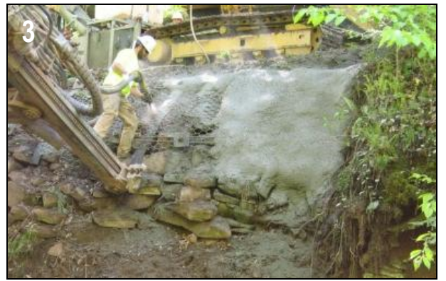
Francis Road: Wire mesh is tied into the exposed ends of the soil nails, then a "shotcrete" facing is added.