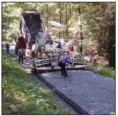
Paver placement of DSA.